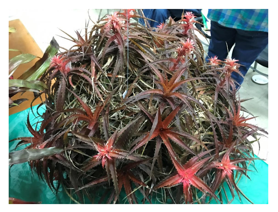
Auctioned: immense basket of Orthophytum 'Copper Penny'